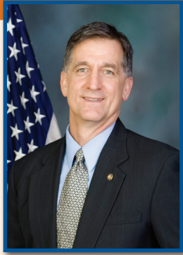
Mark M. Gillen State Representative 128 th Legislative District

DISTRICT OFFICE: 29 Village Center Drive, Suite A7 Reading, PA 19607 Phone: (610) 775-5130 Fax: (610) 775-3736